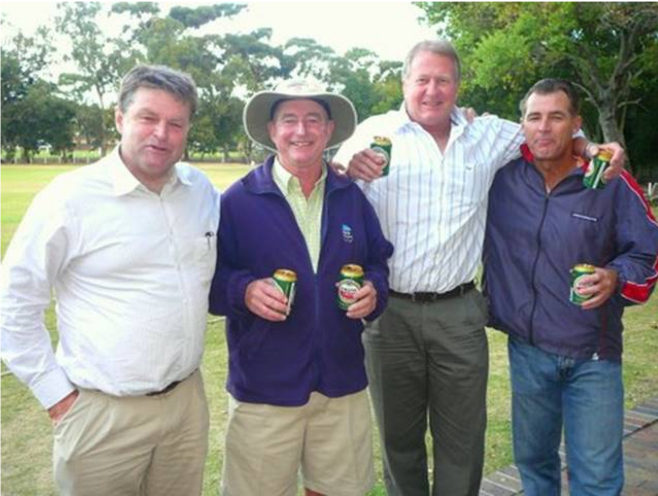
Supporting Bosch Cricket? - or supporting one another?