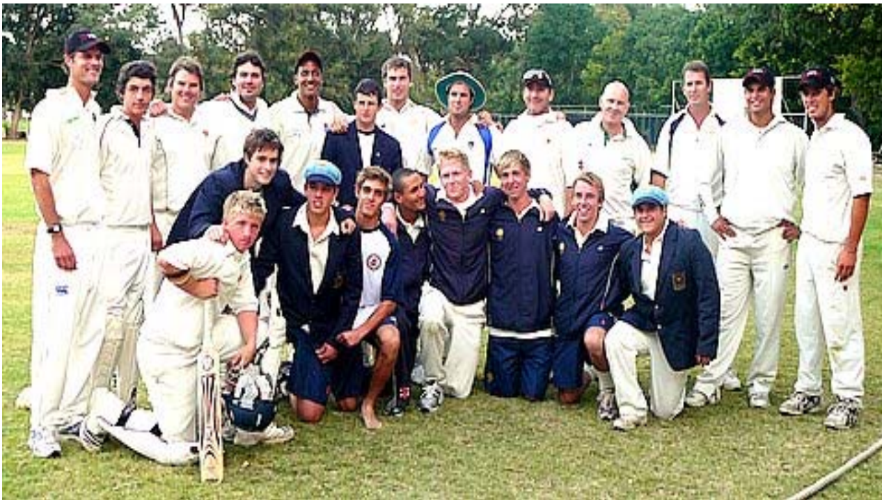
Bosch Firsts Vs. Bosch Old Boys - smiles all round.

Please e-mail your Photos to Sparkman@Mweb.co.za or MMS them to 083 325 7291 for publication.