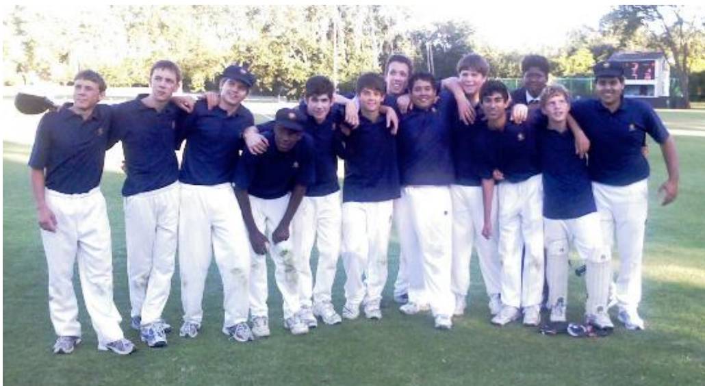
The Bosch 5ths in Bishops Territory.