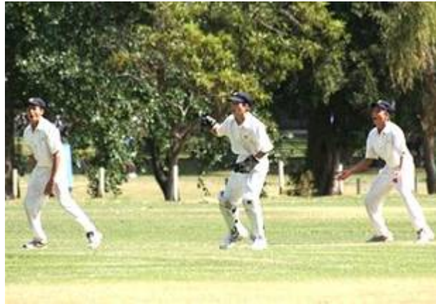
Howzat - close!! - but not quite.