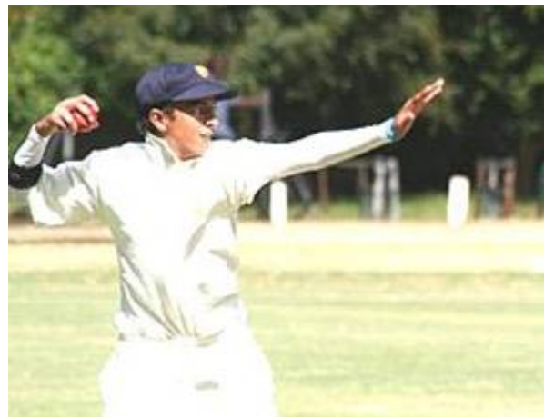
Zubayr!! - direct hit and you out (twice)