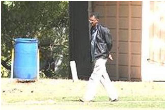
An U15A parent "paces on the perimeter" during the Bosch vs. Grey PE match