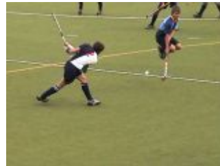
Mickey - getting out of the way.