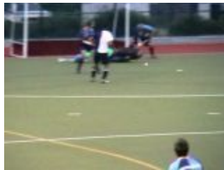
1. Keeper "breaks his back" saving this one.