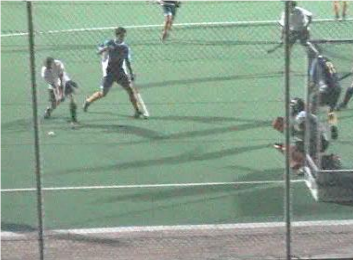
Cole sets up Graham for a good finish.