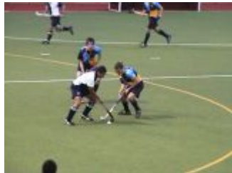
Kyle & Graham gang up on Wade