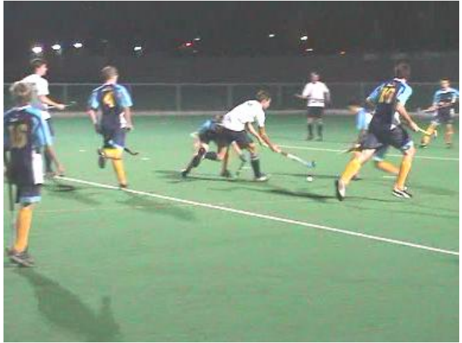
Cameron beats 4 defenders.