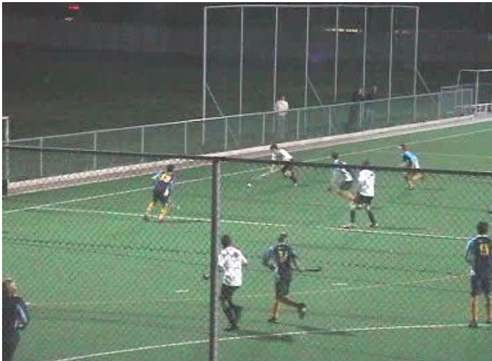
Sparkie & Co seal the back.

Bosch 1st vs. D.F. Malan (Knock Out Match) - Bellville Astro Monday 8 June 2009 (Please note Rondebosch were playing in WHITE tops)