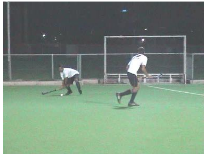
AB in action