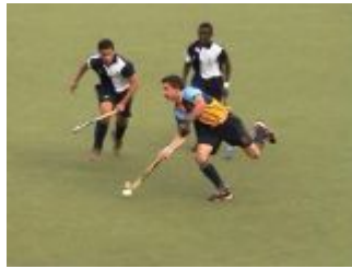
Cole beats two.