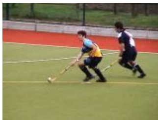
Robin cleaning up.