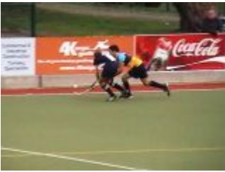
Cole beats Luke.