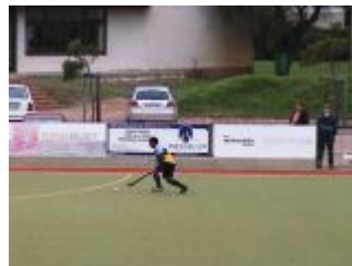
AB setting it up.