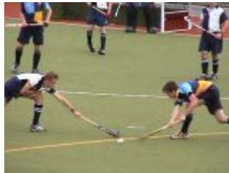
Kyle cleaning up too.