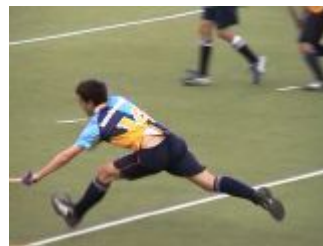
Sparkie at full stretch.