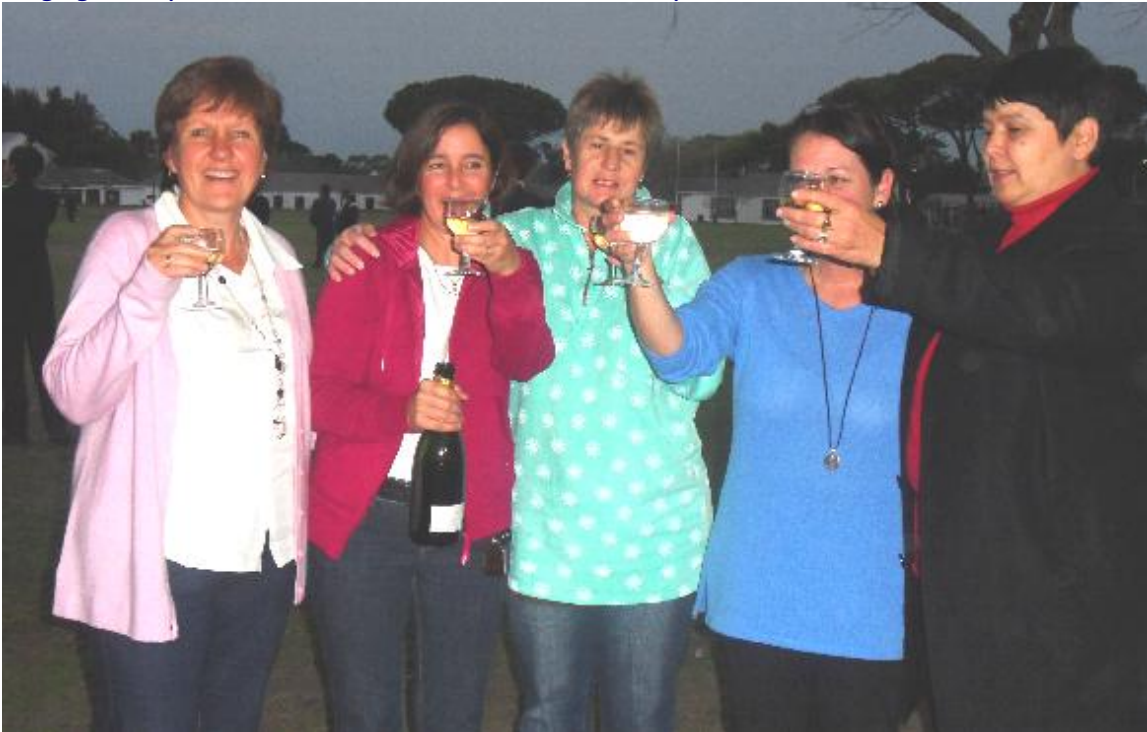
Bishops and Bosch supporters drinking a toast to the outcome before the match.