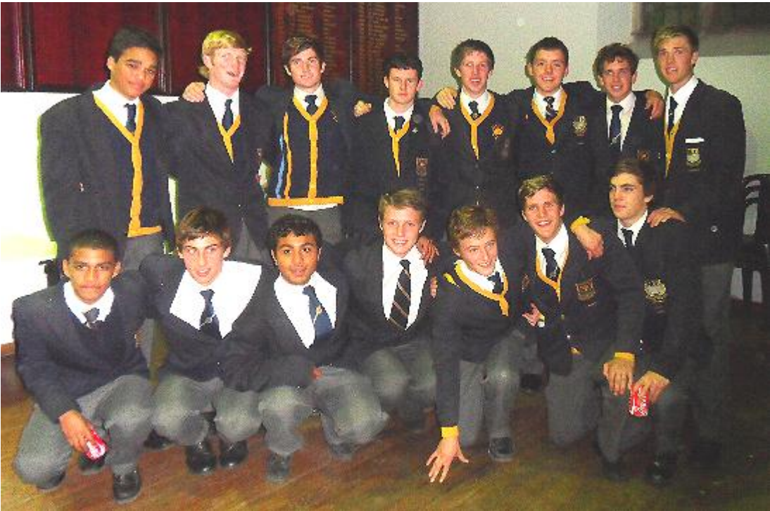
All smiles still - Bishops may have won the match but Bosch "gees" was not defeated.