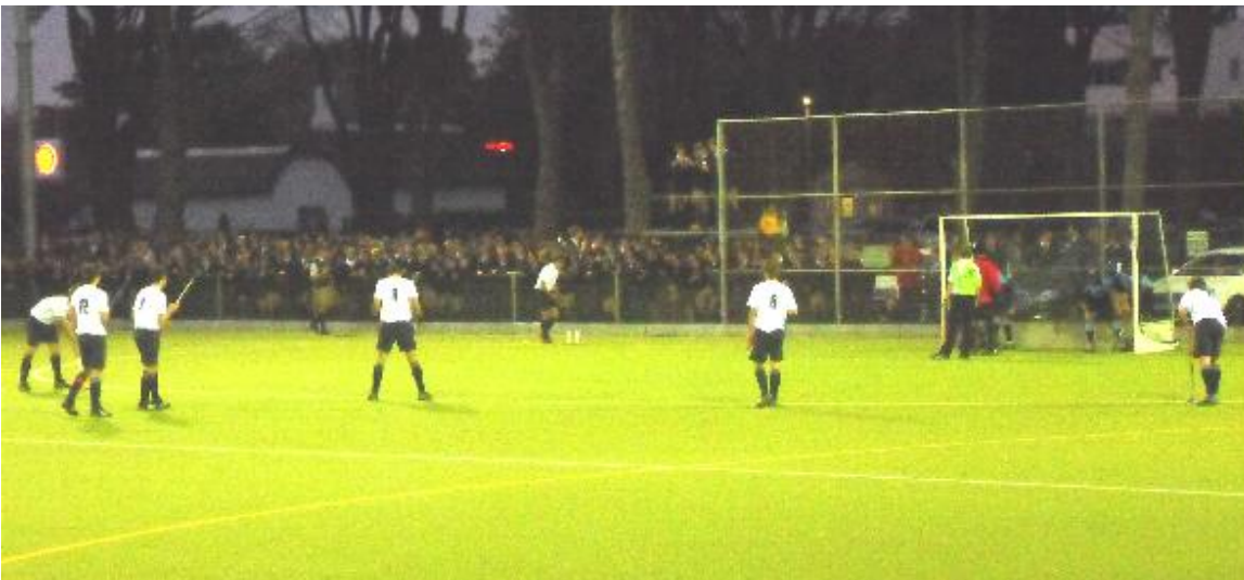
Bosch lining up for a shortie.