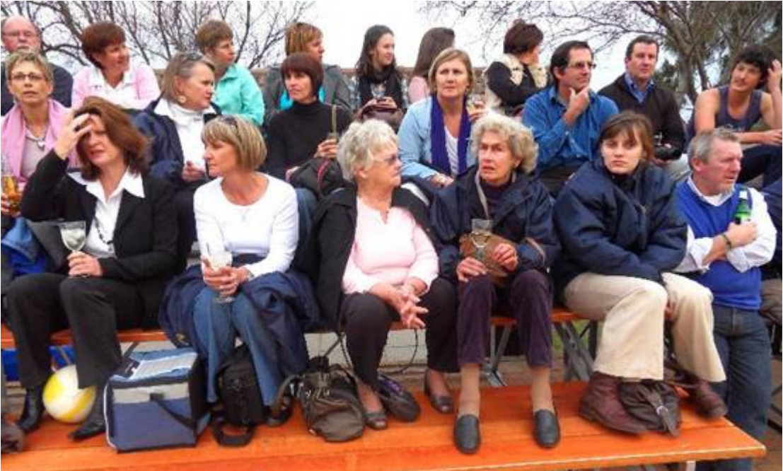
And the customary Bosch "support squad" were there to cheer on the 1 st Team.