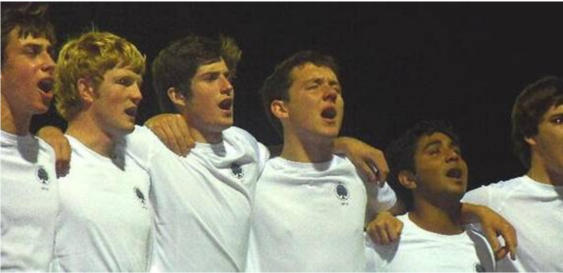
Singing with passion after the encounter with Bishops.