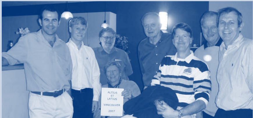
Vancouver Subunion gathering