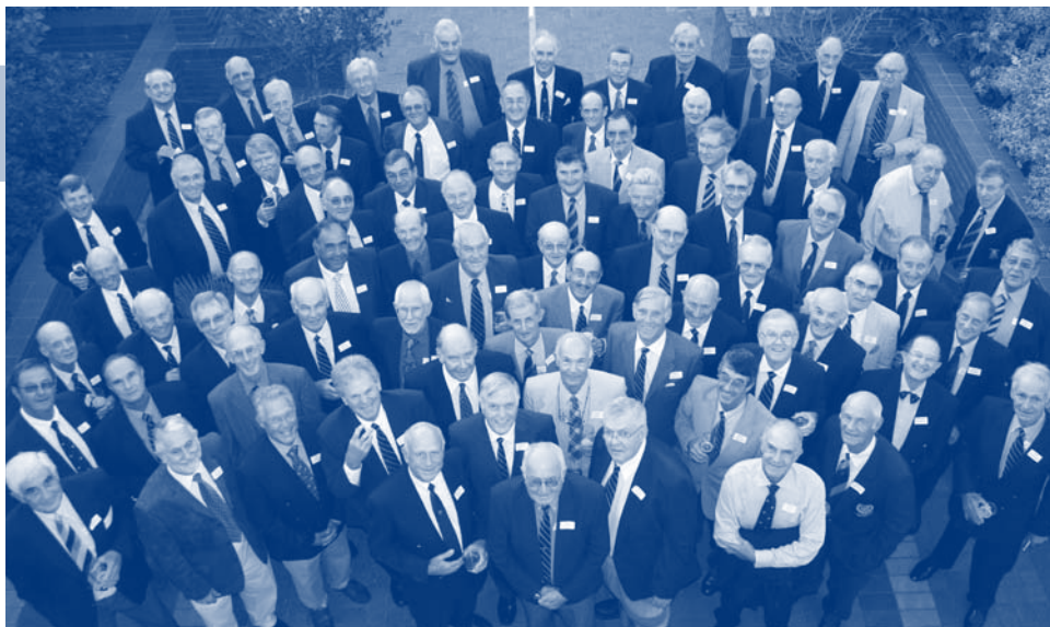
The class of E58 celebrating their 50th reunion with dinner at the Mowbray Golf Club.