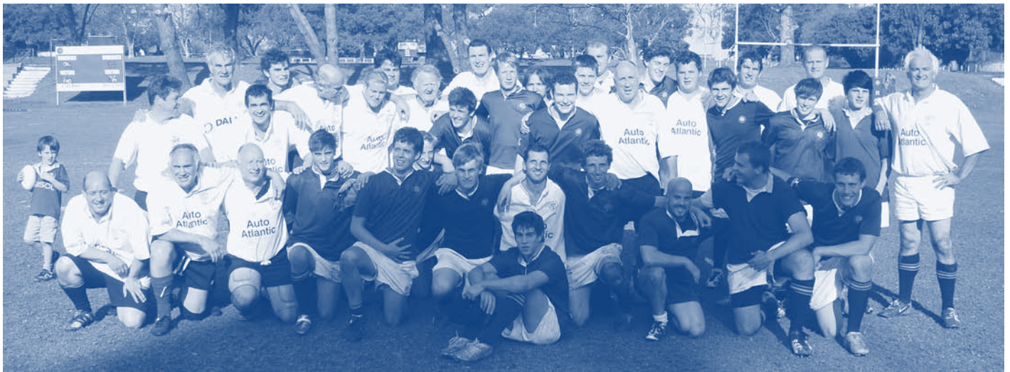
A group photograph of some of the teams, both school boys and Old Boys, at the annual Winter Sports day.