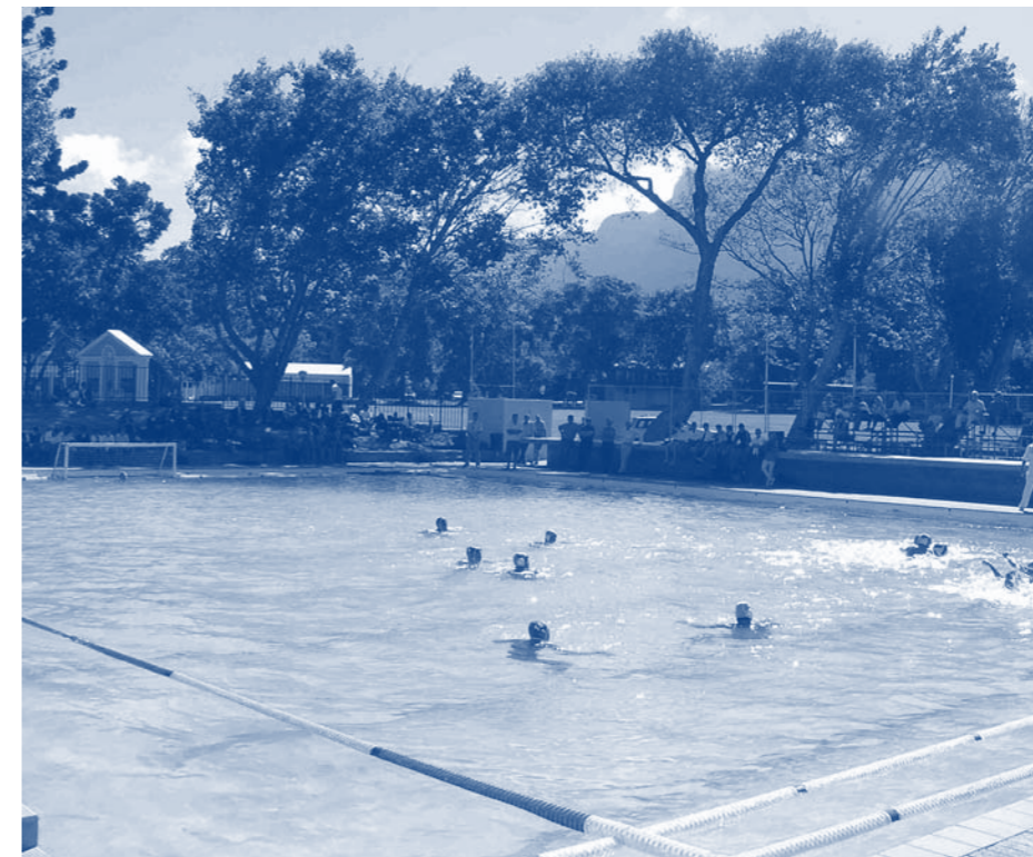
The new swimming and water polo pool at RBHS which was officially opened in March this year.