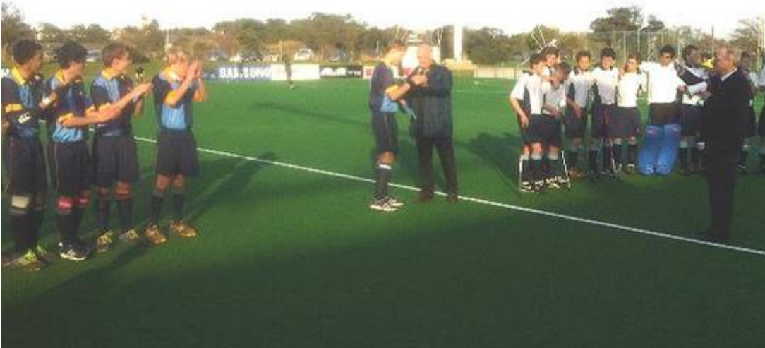
Receiving the silver ware.