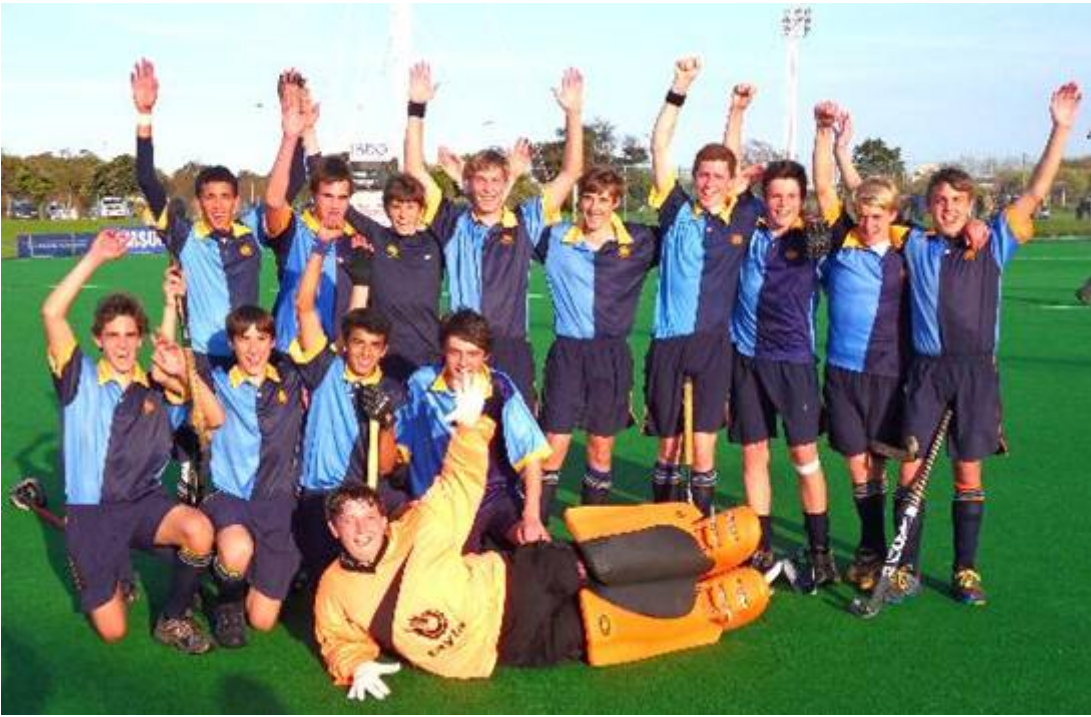
"We did it" - Jubilation