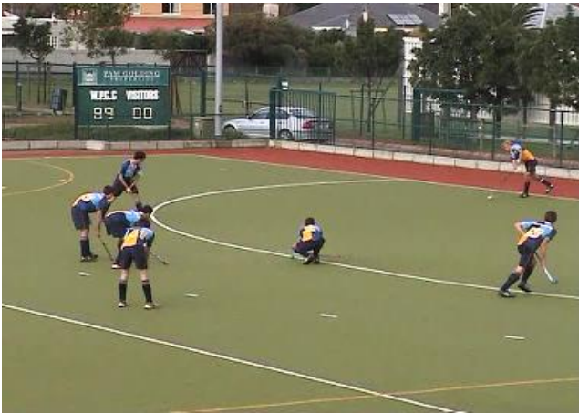
Goal #2 in sequence. 1. Shortie on the whistle to win - Peter Schwellnus