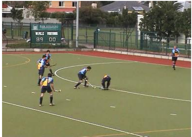
Goal #2 in sequence. 2. Shortie on the whistle to win - Cameron Prins