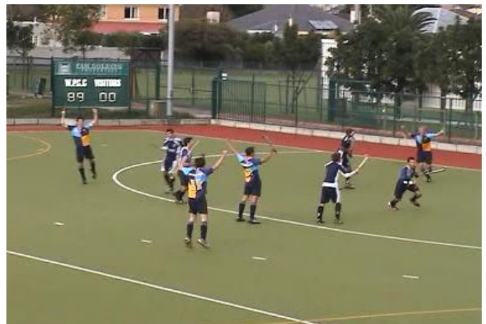
Goal #2 in sequence. 4.