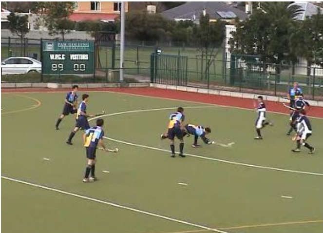
Goal #2 in sequence. 3.