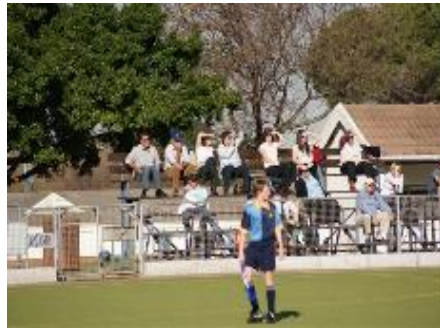
Spectators battle the sun (and 25C heat)