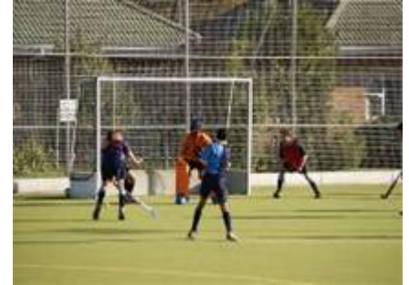
Deflection off JP