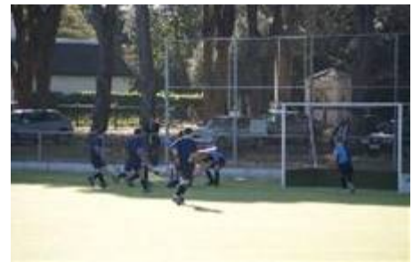
JP reverse sticks.