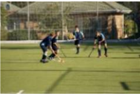
Defence is solid.