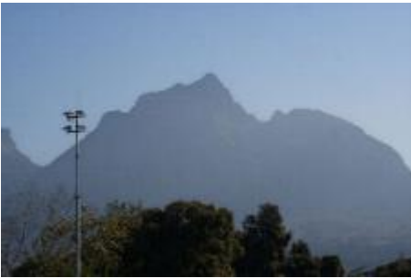
Welcome to Bishops

This week it is the U14A Team