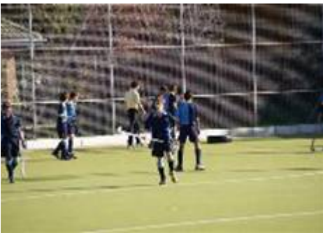
Bishops finds the left flank awake. Kyle starts the attack