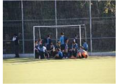
Coach gives half time talk