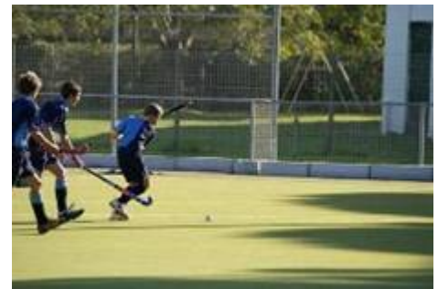
Bosch attacking again.