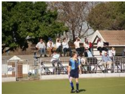
Spectators battle the sun (and 25C heat)