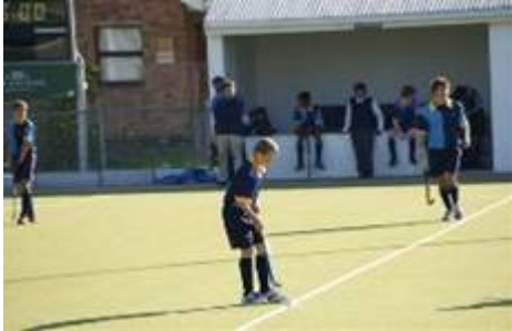
Welcome to Bishops