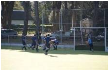
Bishops finds the left flank awake. Kyle starts the attack