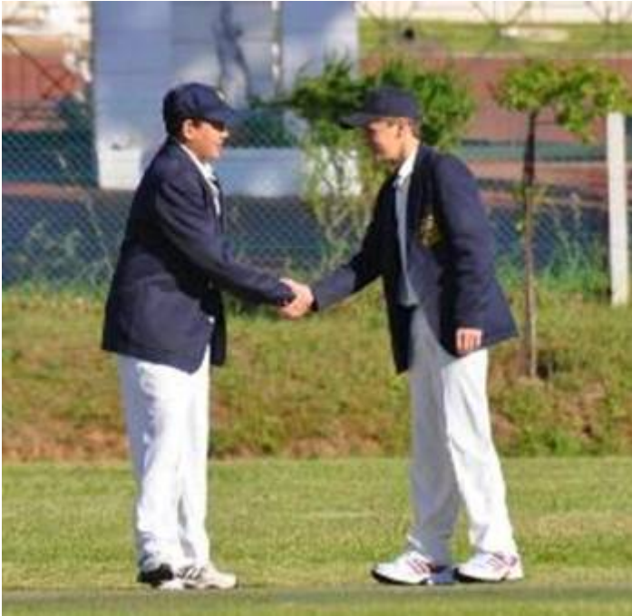
Winning the toss.