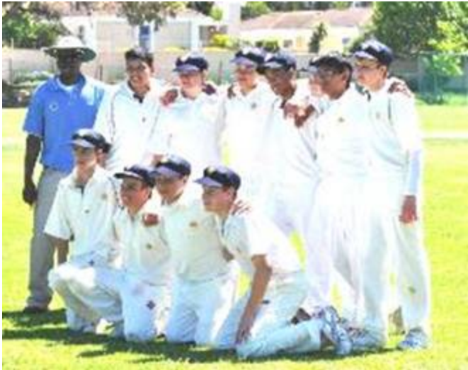
After the match