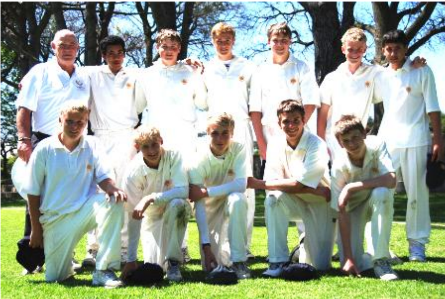
Our Team - after beating Boland Landbou by 6 wickets.