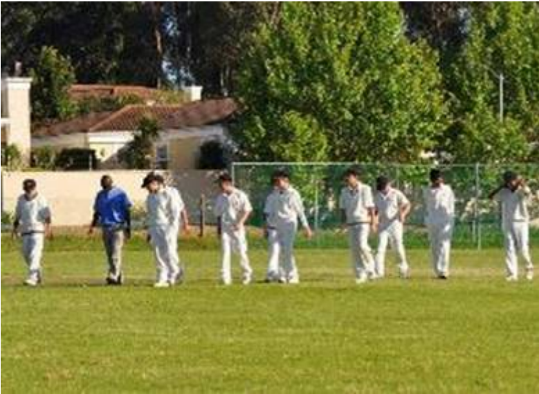
Bosch U14B about to start the match after a warm up.