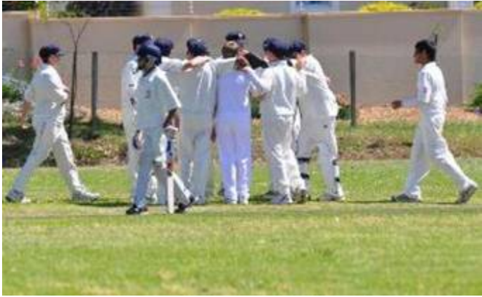
Another wicket falls.