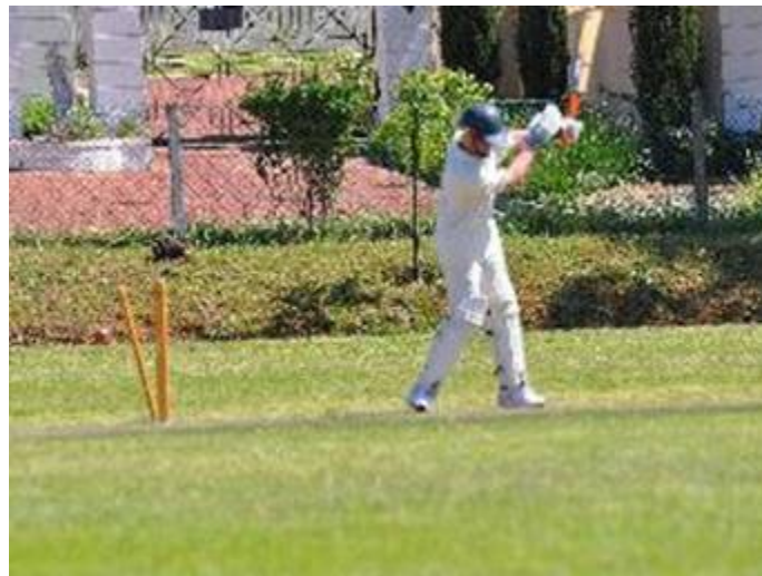
One of Preshant's wickets.