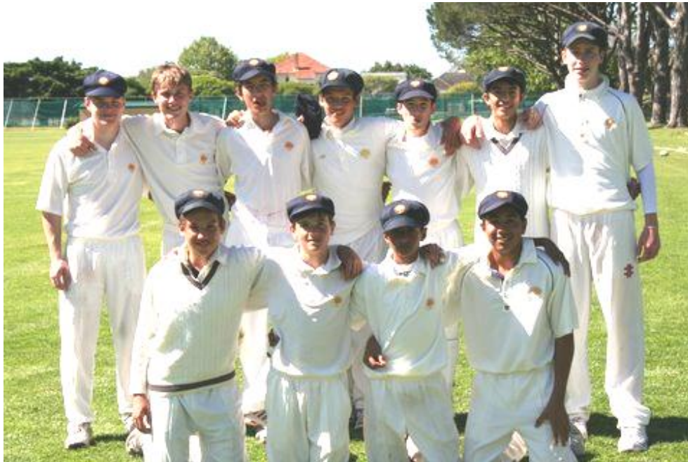
Our proud and victorious U14A Bosch team