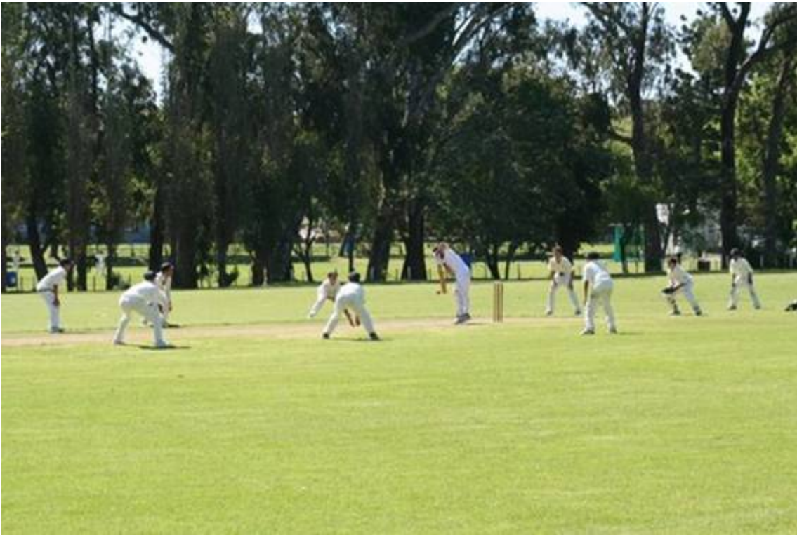
Our fielders putting on the 'heat'