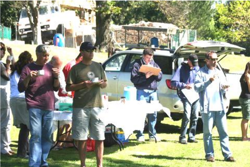
First class Bosch traditional hospitality - teas and eats under the trees.