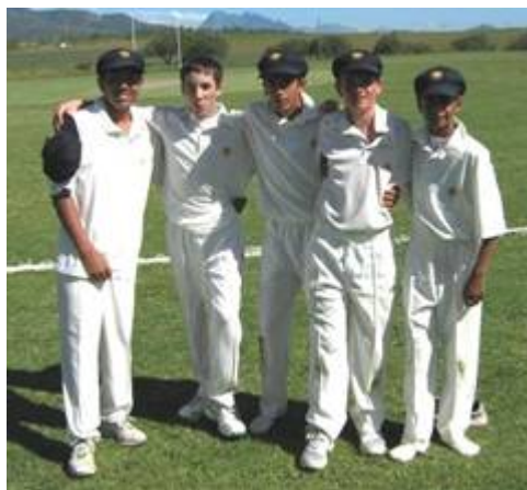
The U14A Team savouring their sweet victory and some of the boys who worked their magic for the team.