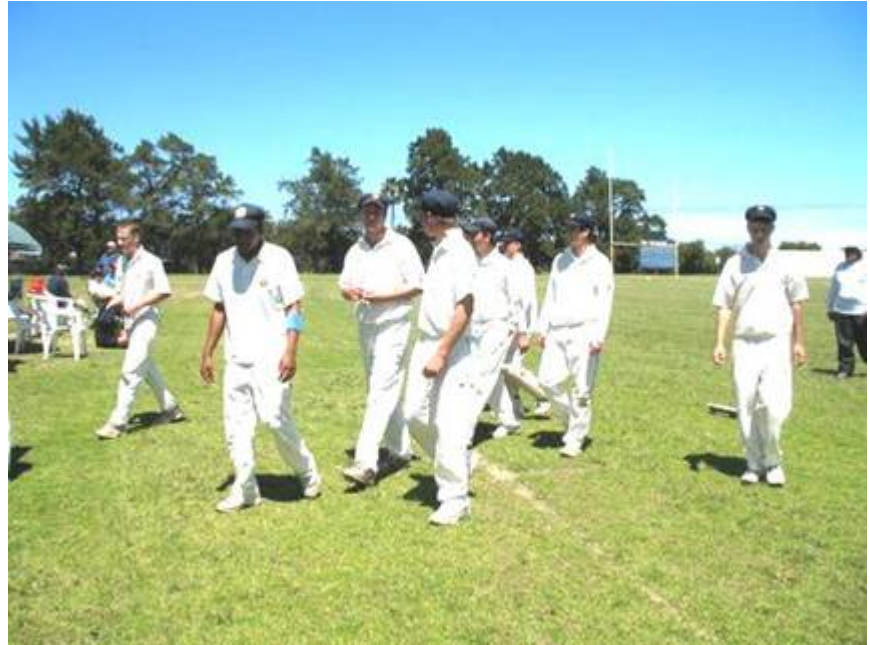
Drinks Break at Bellville HS