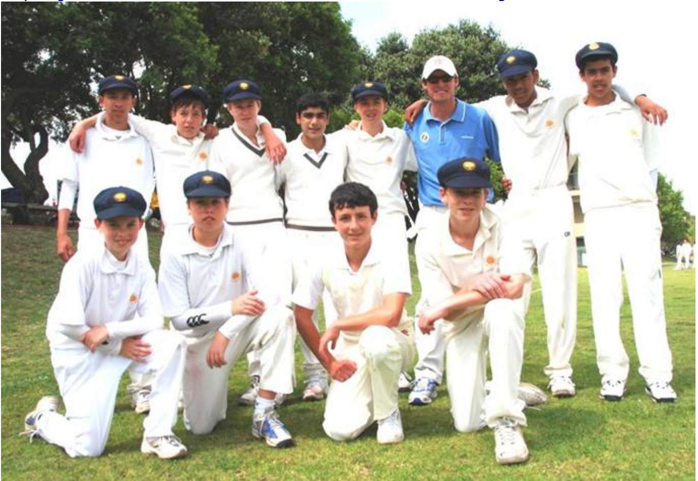
The Bosch U15B boys are back in town!