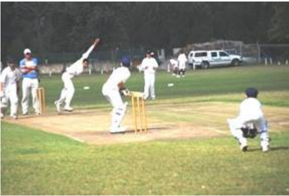
Justin Kraak bowling (2 wickets)