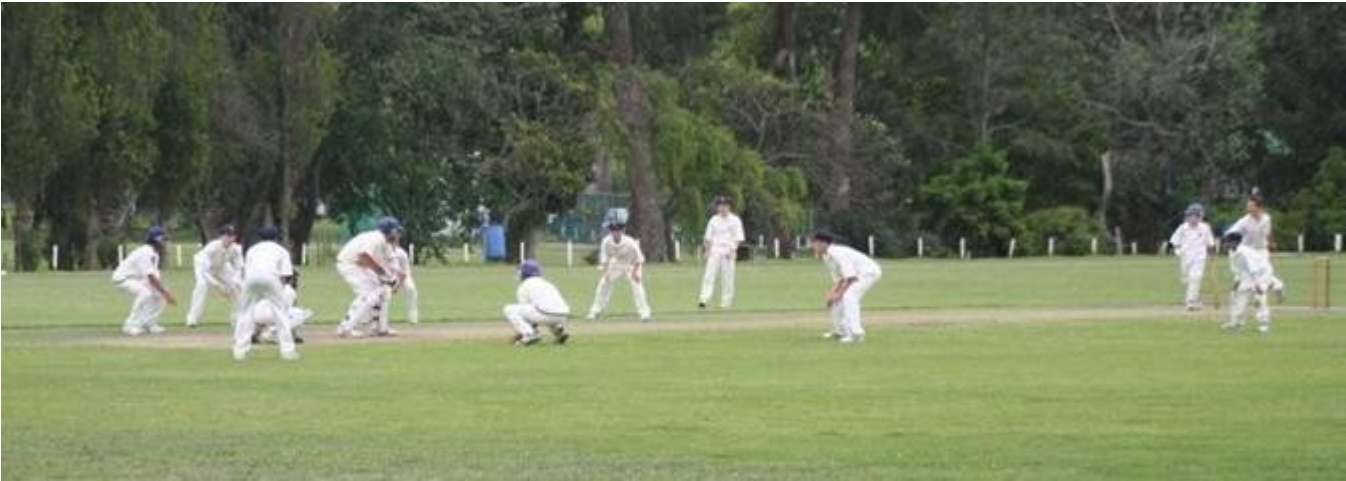
Our boys push up 11 around the bat.