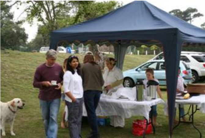
Bosch hospitality again comes out tops.