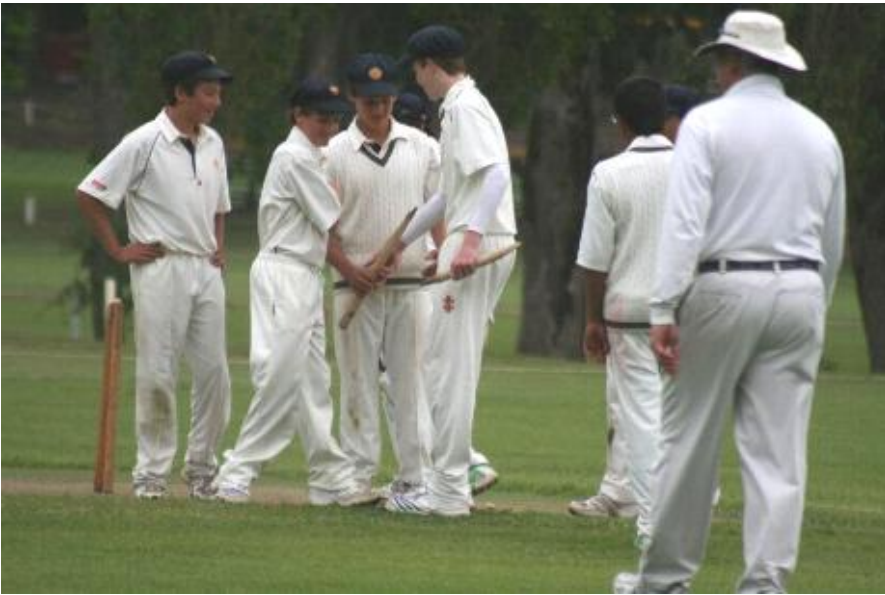
The boys enjoy the direct hit and the broken stump