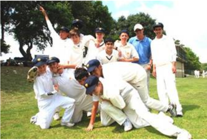
Way to go - Bosch U15B