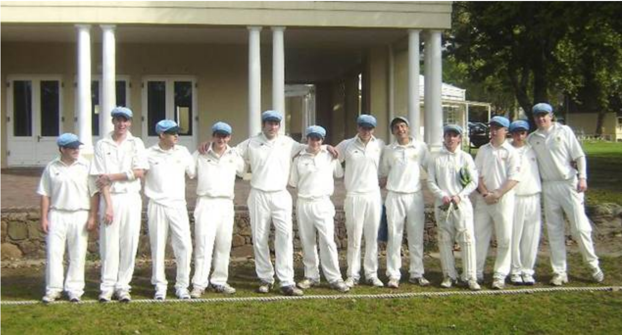
Bosch 1 st XI taken during the Cape Schools Week

Please e-mail your Photos to Sparkman@Mweb.co.za or MMS them to 083 325 7291 for publication.