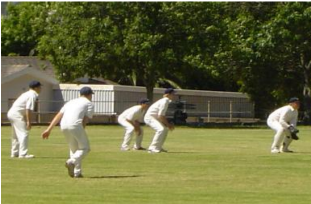
Bosch slip cordon.