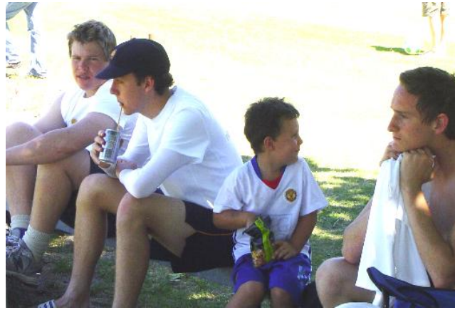
The wait is on.