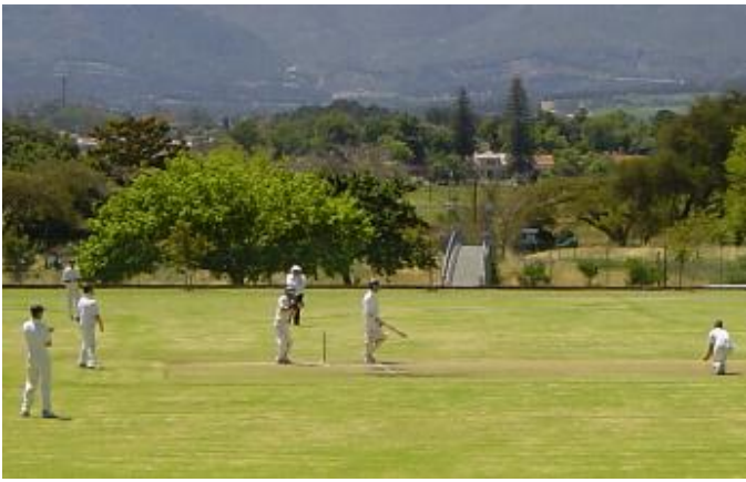
Sparky surrounded by Boishaai "sharks"