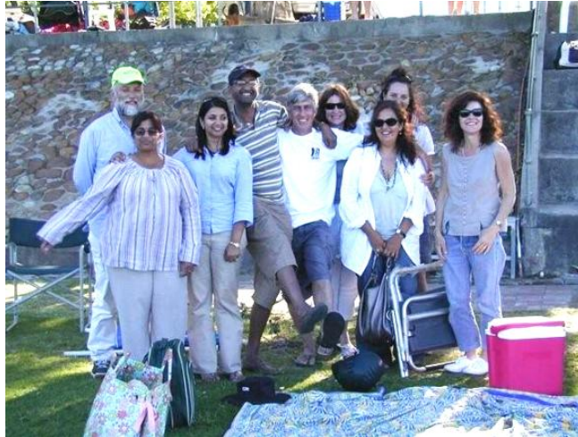
The Bosch U14A parents in high spirits in Paarl