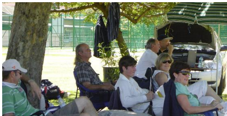
Happiness is a shade tree in Paarl