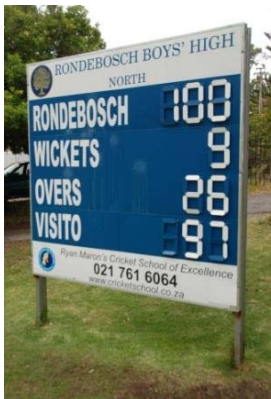
The scoreboard shows the close finish