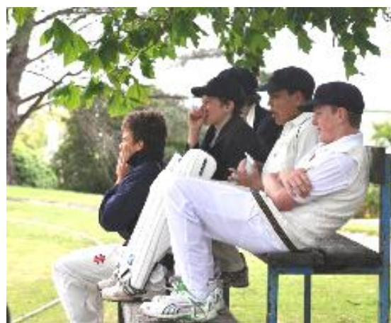
RONDEBOSCH BOYS NEEDING ONLY 46 RUNS TO WIN