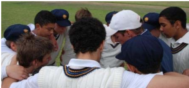
Team discussing the win by 3 runs - a very close call