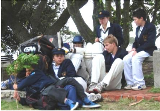
Hiding from a strong wind behind a wall of cricket bags