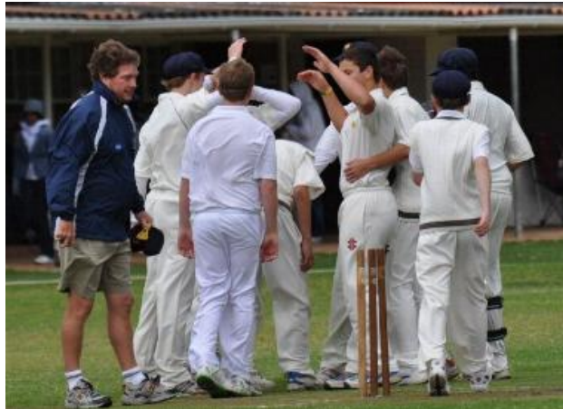
ANOTHER WYNBERG WICKET FALLING