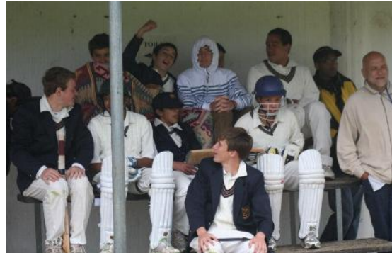
Our boys, tense but confident