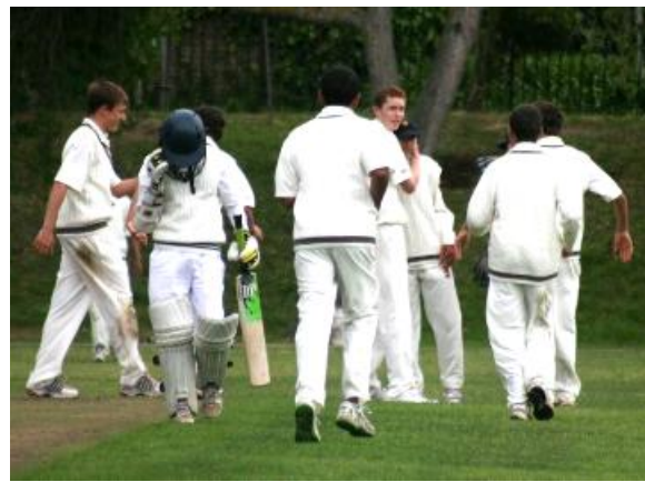
Thanks mate, we needed to get that one.