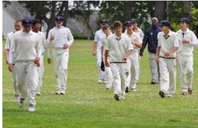
AFTER BOWLING WYNBERG ALL OUT FOR 45