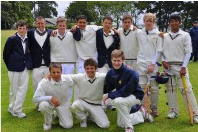
UNDER 14B WINNING TEAM