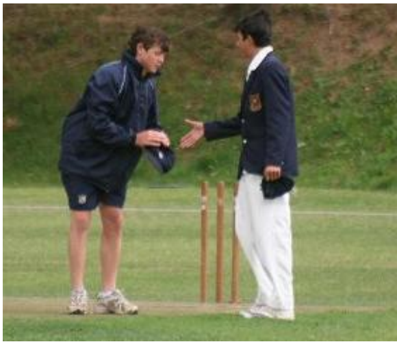
Let's start by winning the toss.