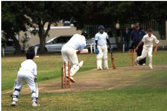
After Wynberg scored 46 for no loss wickets started to fall.