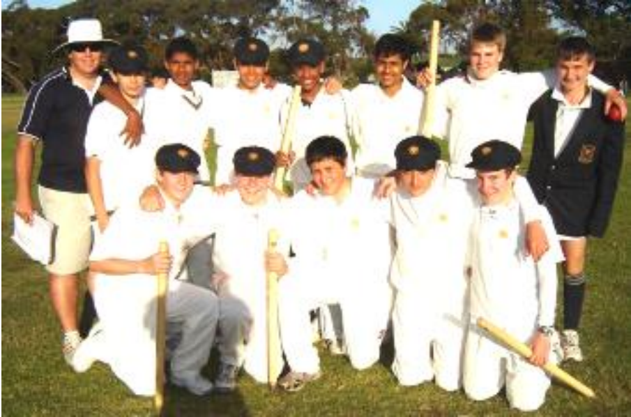
Bosch U14C after the 20/20 vs. Wynberg.