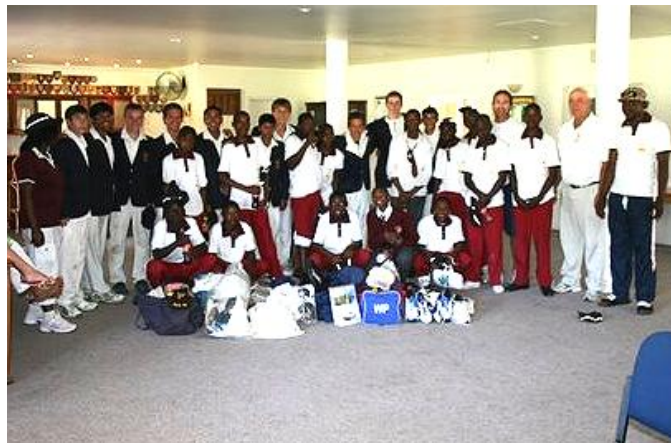
Friends forever - sharing is caring