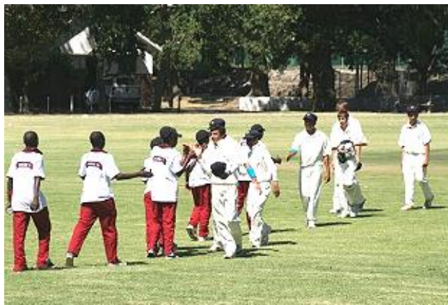
All smiles at the end of the game