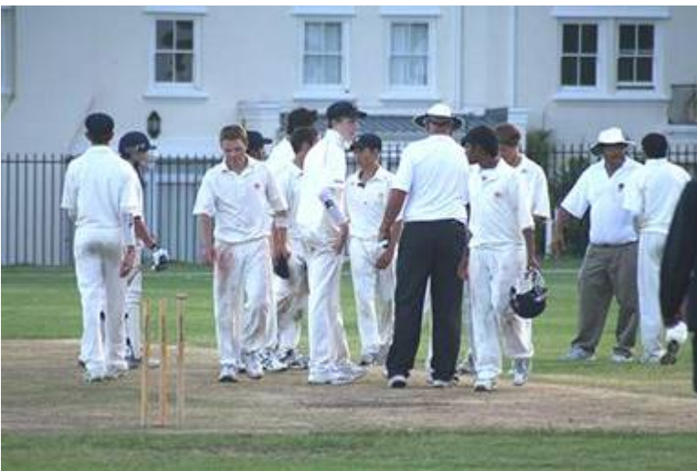
Great game - Great escape SACS