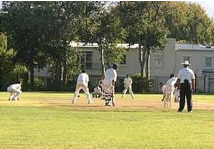
Prashant Makan's left arm swing had them perplexed