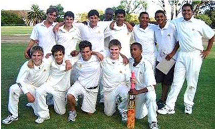
Rondebosch U15C Team at the SACS Match