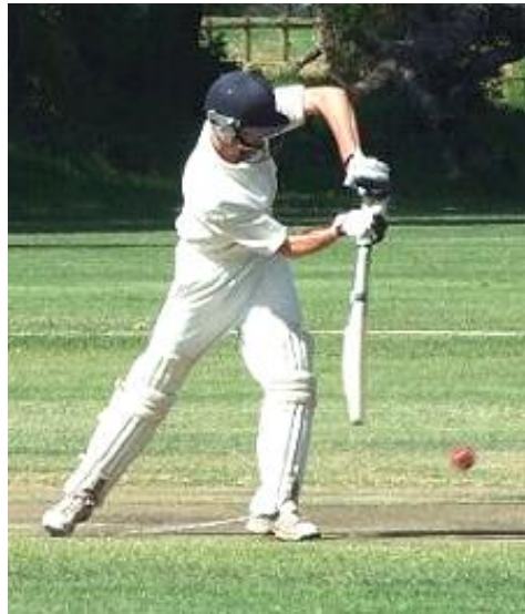
Solid play by Kabot.