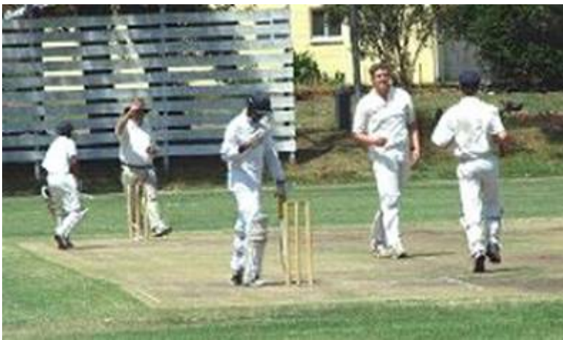
The finger says "OUT"