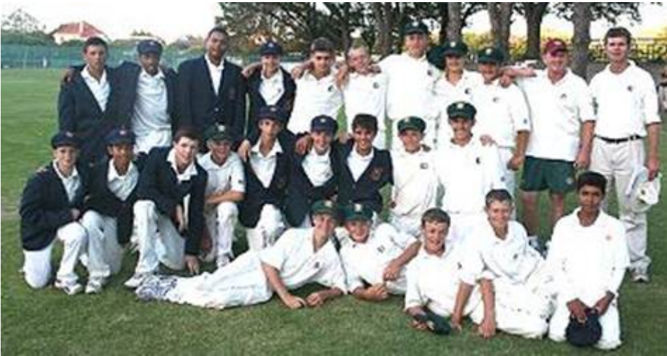
Bosch U14A vs AFFIES U14A