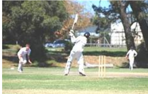
Taariq plays a drive towards the end of the game - with RBHS ending just 4 runs short of Wynberg