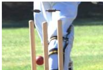
And the bails blast off.