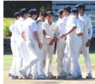
Celebrating a wicket.