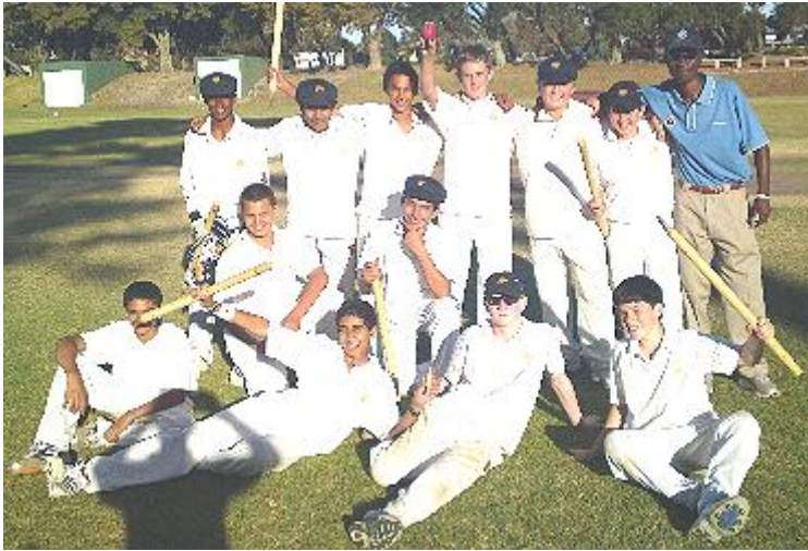
The U15D Team