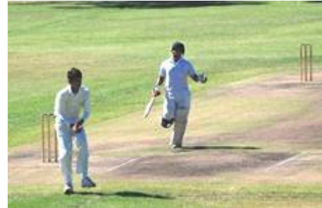
And the ball is safely "cupped" in his hands