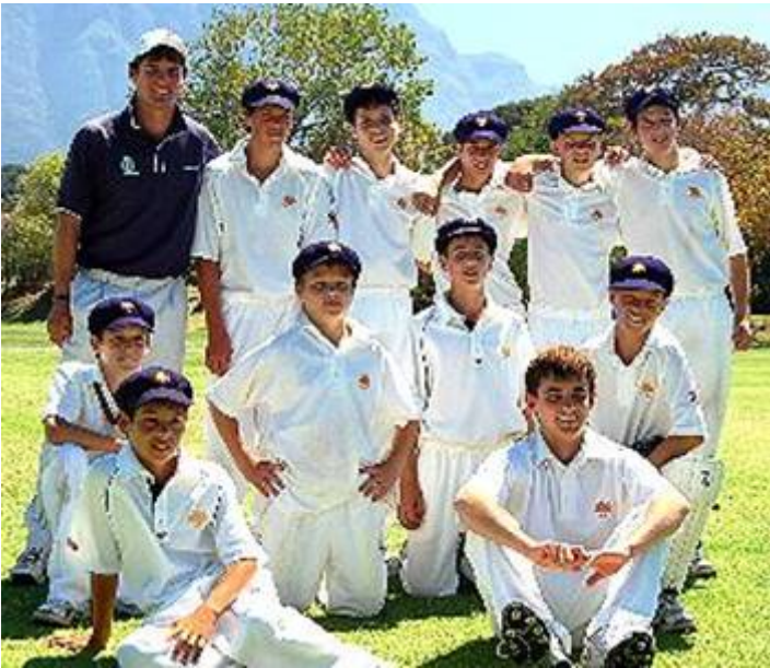
Bosch U14B team moments after they beat Wynberg U14B.