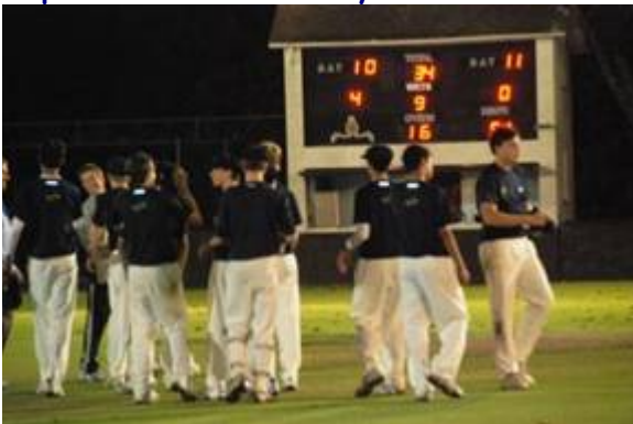
Bosch 3rds celebrating - the scoreboard tells the story - Bishops out for 34 in the 16 th