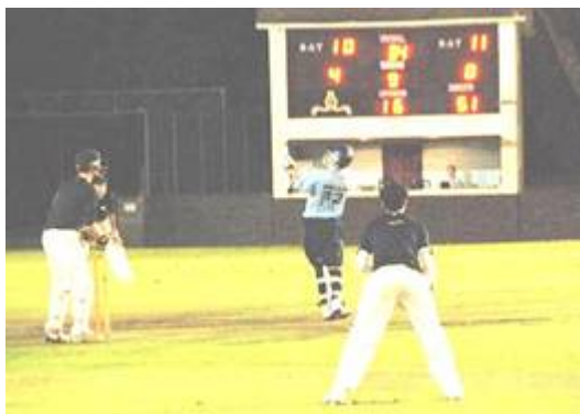
Themba Bosch gets a wicket.