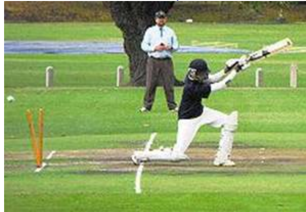
Oops Sufy - more timber flies into the air.