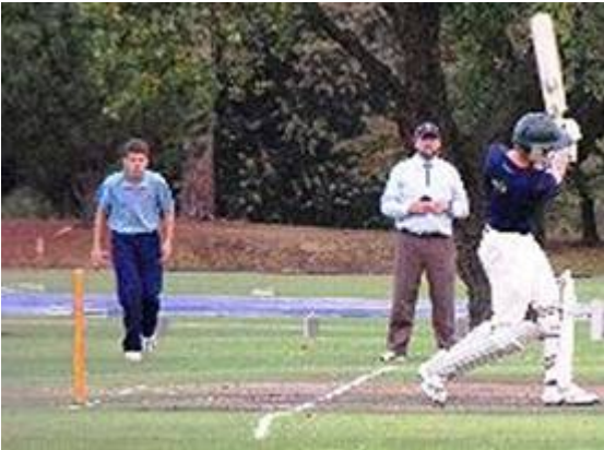
Oops Dono! - the bails fly