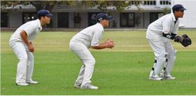
The slips poised for action.