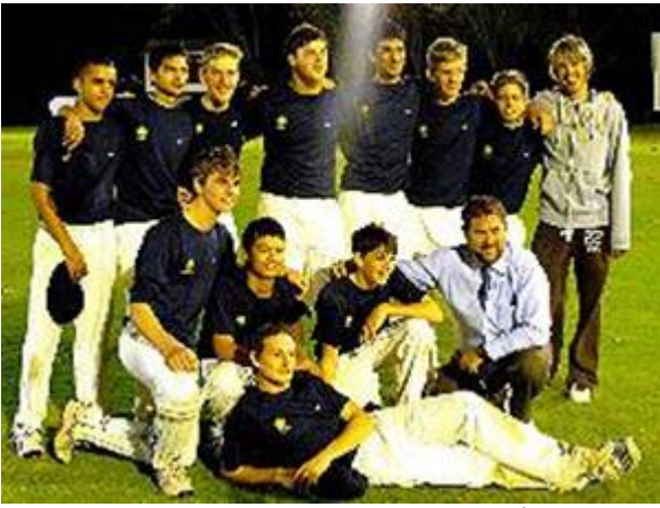
The "Bishops Bashers" aka Bosch 3 rd XI