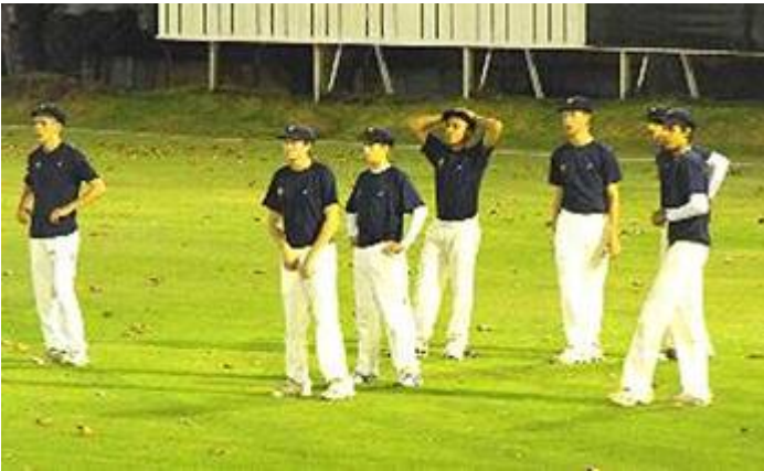
Ready for the kill.