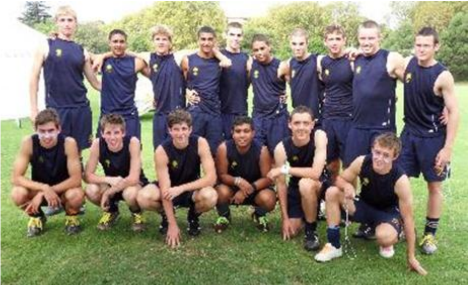
The Bosch Team warming up at Parktown Boys High School