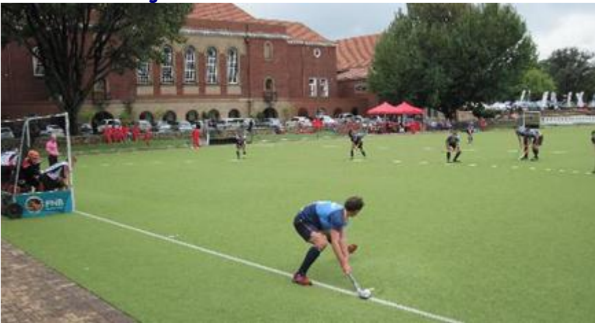
The Bosch "shortie" squad.