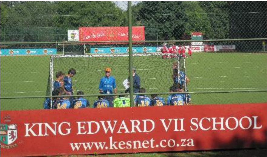
1 st Team Strategy talk at KES Hockey Festival