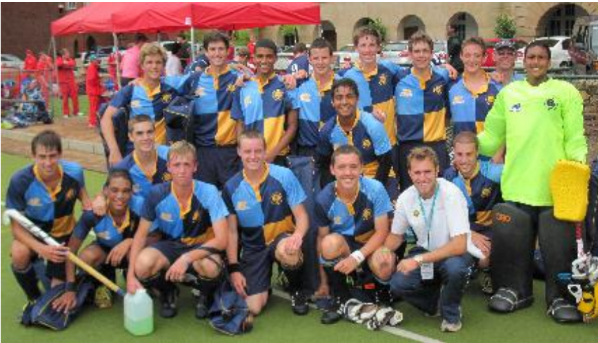
Bosch 1sts having done battle at KES