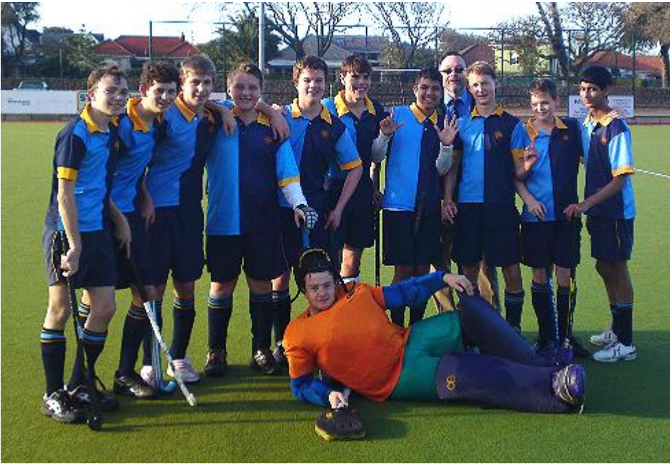
The Bosch U16E Team