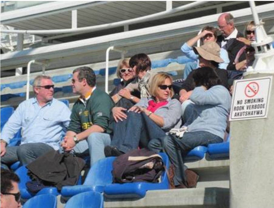
No Smoking on the stands but things were smoking on the Astro. The Bosch 1 st 's support squad enjoying the Sun and the Hockey.