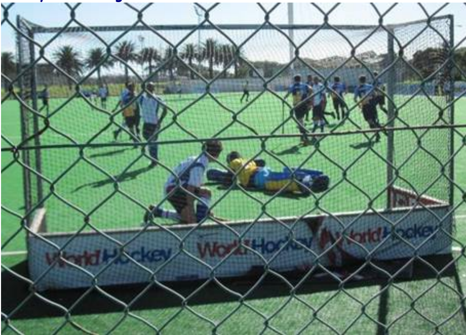
Pinelands despair after Bosch scored.