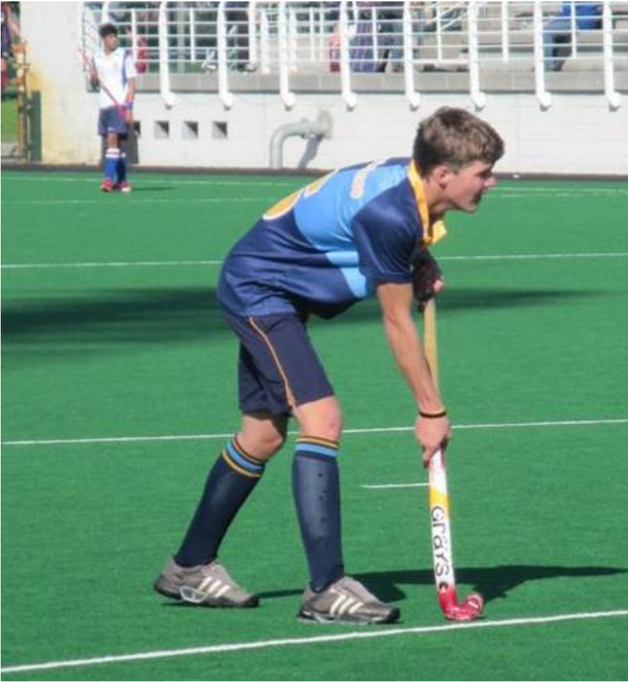
Mickey scored 2 goals.