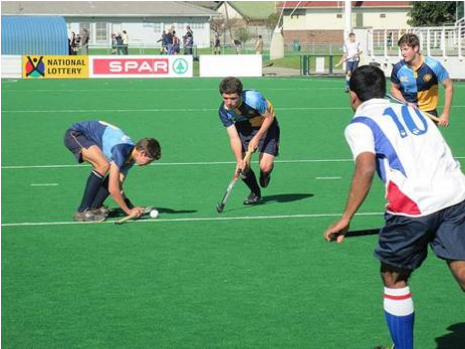
Bosch Shortie squad